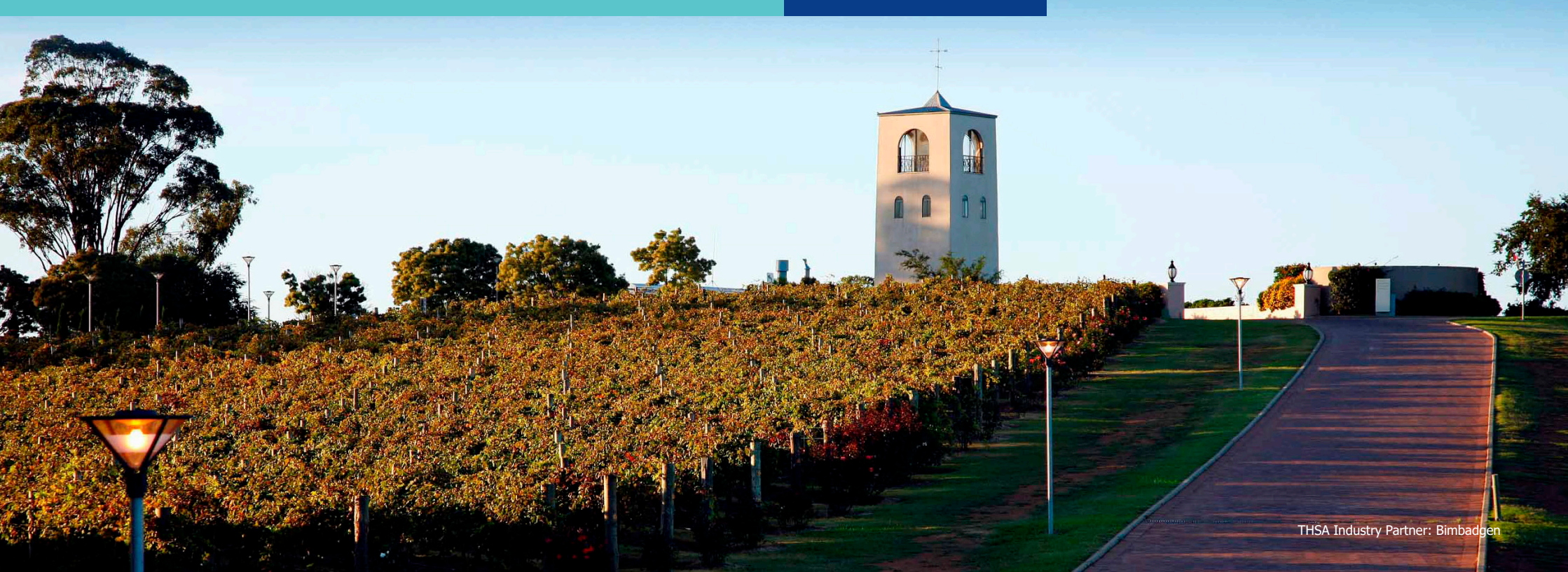
THSA Industry Partner: Bimbadgen