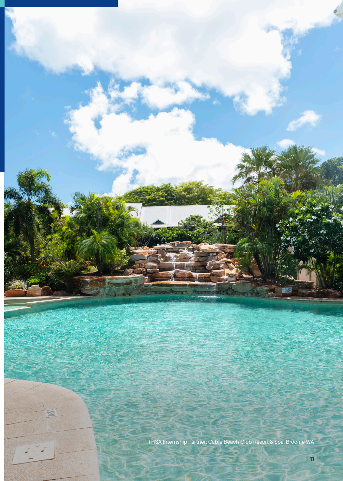
THSA Internship Partner: Cable Beach Club Resort & Spa, Broome WA